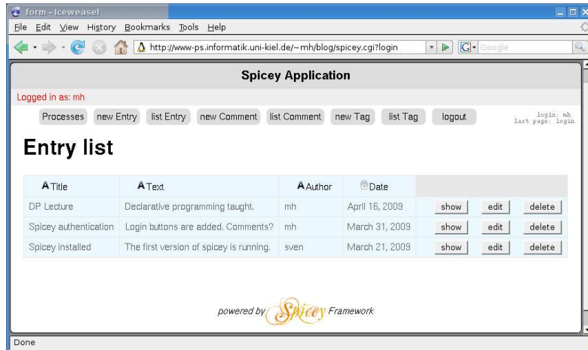
Fig. 2. The web interface of an application generated by Spicey